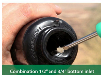
Combination 1/2" and 3/4" bottom inlet