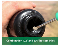
Combination 1/2" and 3/4" bottom inlet