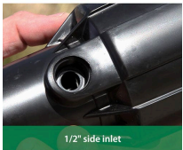
1/2" side inlet